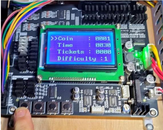
Coin, Time, Tickets, Difficulty.