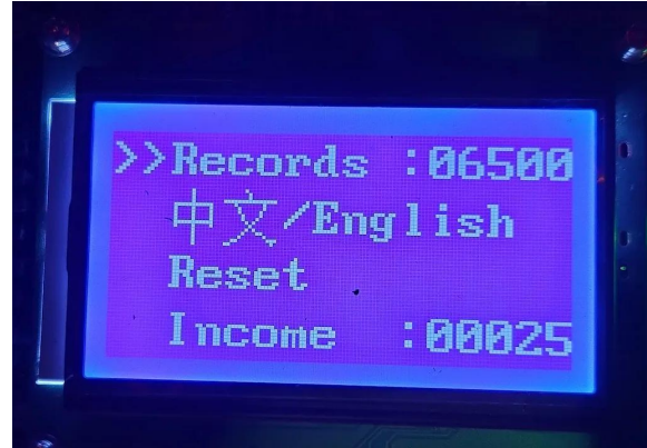
Records, Language, Reset.